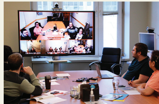
Boardroom-based unit – used for accessing educational programs and administrative meetings.